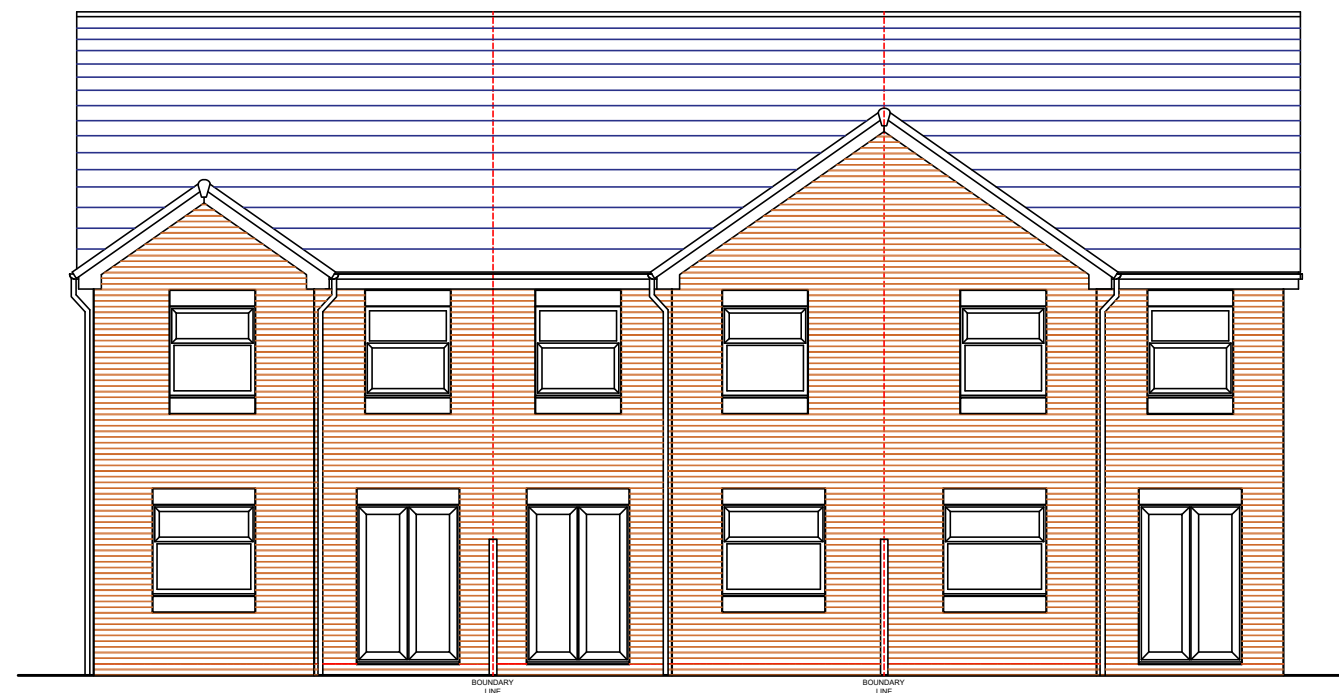
PROPOSED REAR (SOUTH WEST) ELEVATION