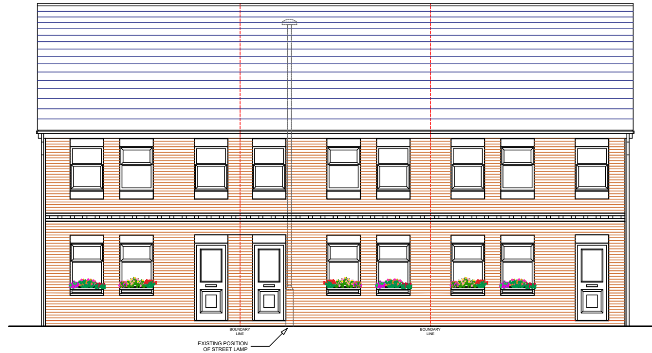
PROPOSED FRONT (NORTH EAST) ELEVATION